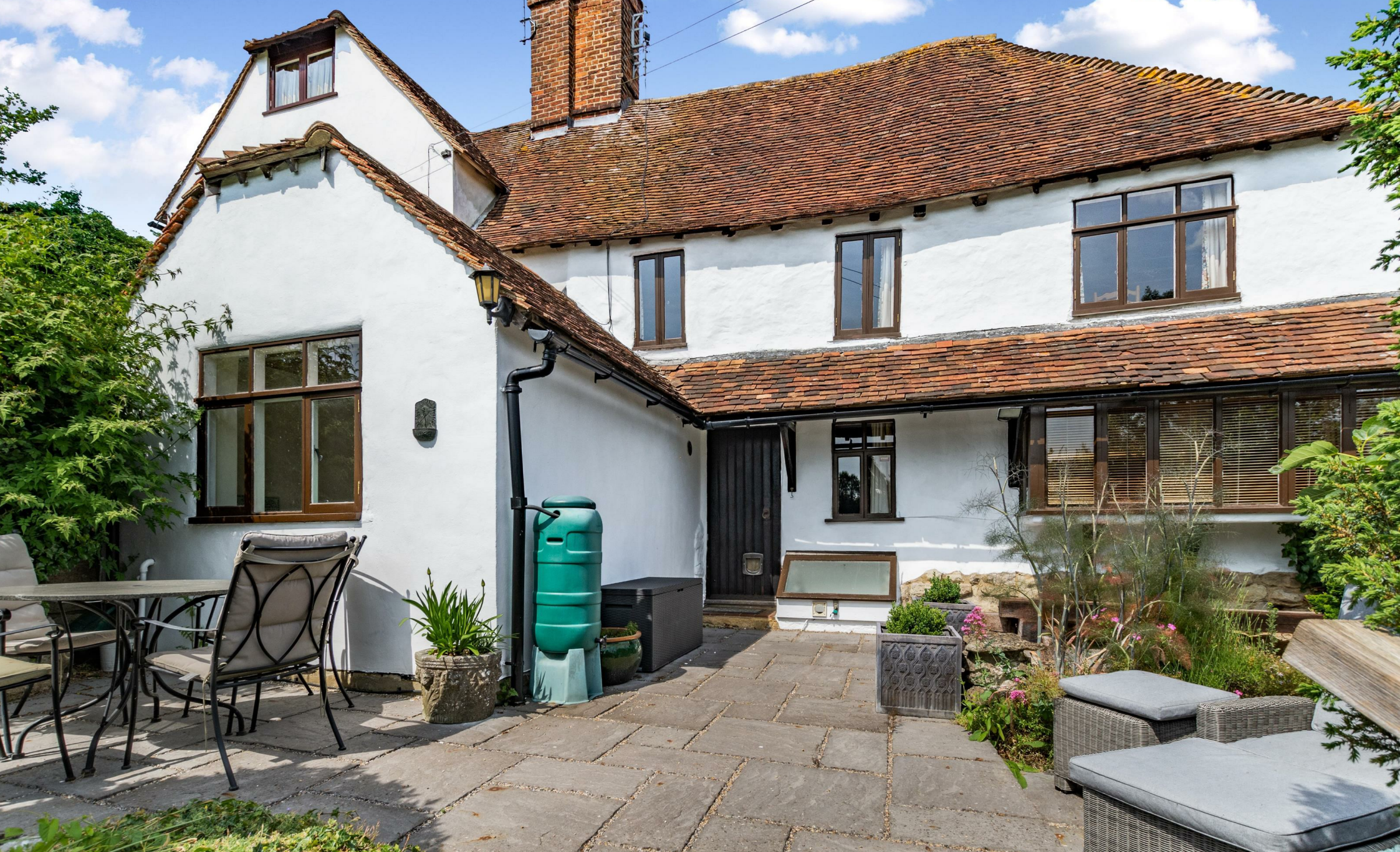
Old Loose Hill, Loose, Maidstone, ME15 0BH Price £575,000